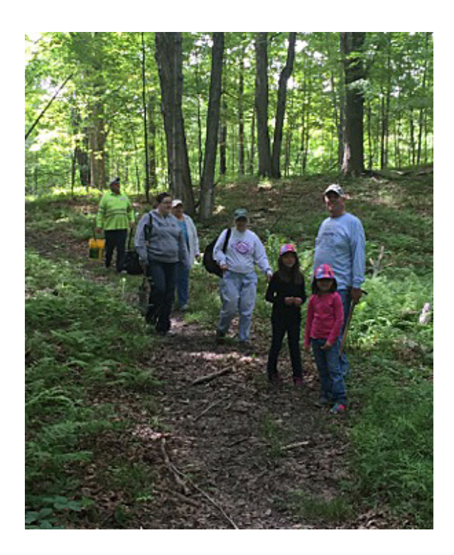
Powers Field Trip Participants

ST. LAWRENCE COUNTY ROCK & MINERAL CLUB Date: August 2015