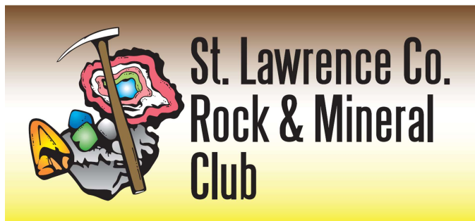
28"x60" banner for the club table