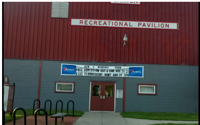
Canton Pavilion, 90 Lincoln St.

visit us @ www.stlawrencecountyminealclub.org