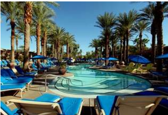
Ah... to be there!

October 25-26; Rochester Gem, Mineral, Jewelry and Fossil Show & Sale; Total Sports Experience, 435 West Commercial Street, East Rochester, NY 14445. Sat. 10-6 PM; Sun. 10-5.