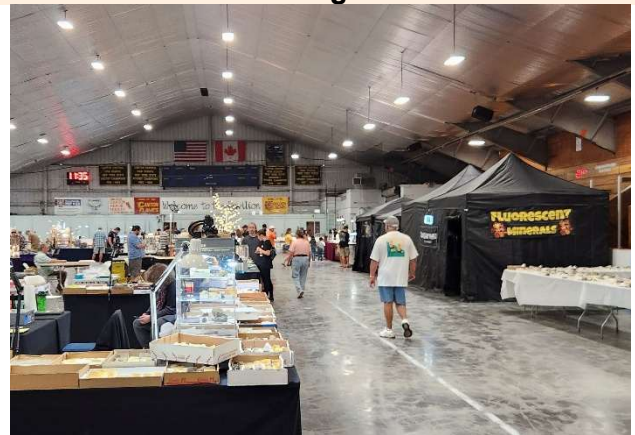
We had two fluorescent mineral vendors this year! The black tents on the right; popular!