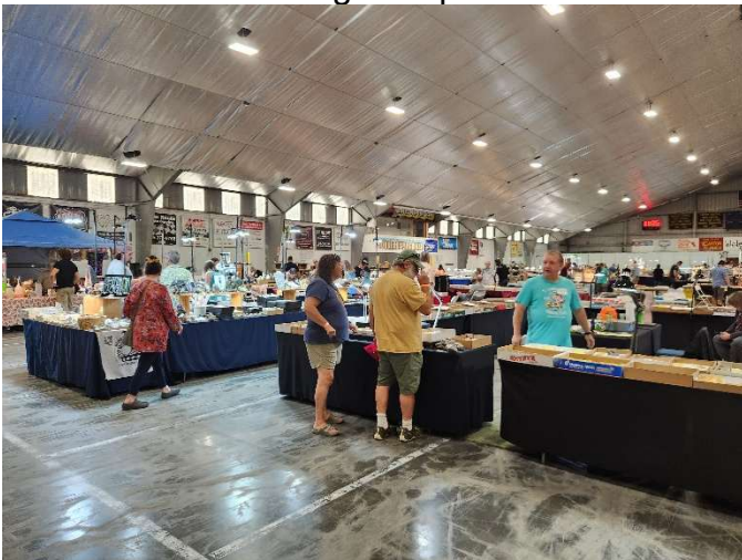
Early Saturday morning, opening day...