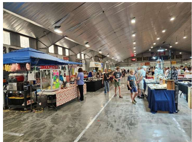
Another view of the Pavilion floor, early Sat.