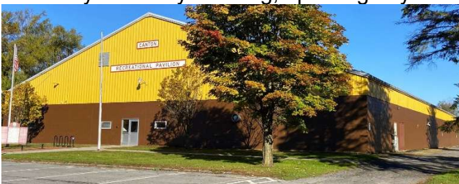
The Pavilion had a facelift!