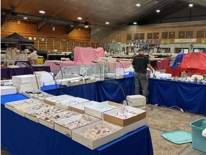
Getting set up...

Here are some more photos of our show floor: