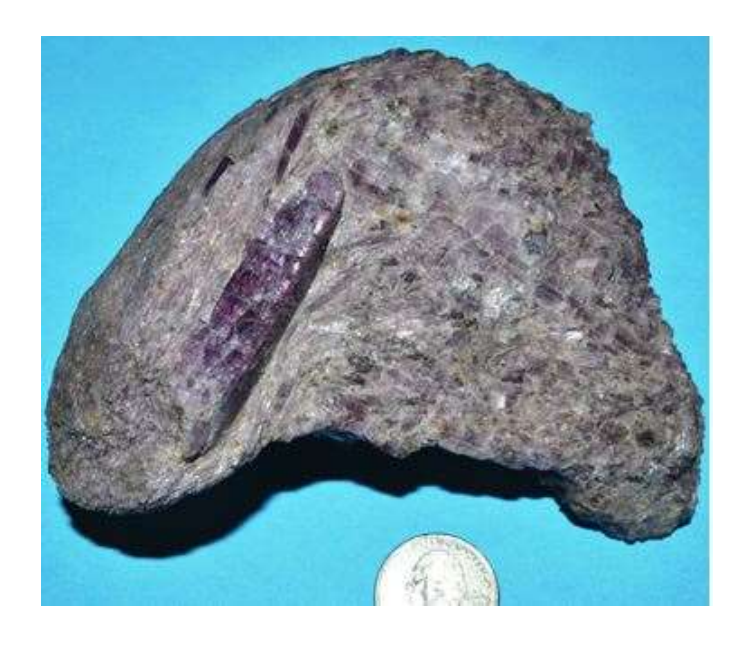
Hexagonite from Ken Rowe's collection.

Note: Hexagonite is unique to New York. Found only in several locations in upstate New York the purple variety of tremolite is colored by a small amount of manganese (Mn) in the crystal structure. Interestingly, it was named hexagonite when originally thought to be a hexagonal form of tremolite. However, it is monoclinic. Technically, hexagonite is not recognized as a separate mineral species, but is just a varietal form of tremolite.