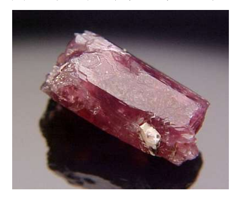
Gemmy Hexagonite (2)