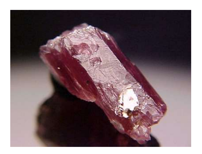
Gemmy Hexagonite (1)

ST. LAWRENCE COUNTY ROCK & MINERAL CLUB Date: December 2016