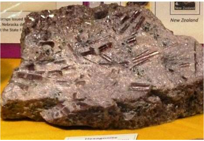
Fred Haynes (From the Wayne County Newsletter) This 8" piece from Balmat displays several gemmy 1-2" long purple hexagonite crystals. (Wayne County Newsletter)

Note: Hexagonite is unique to New York. Found only in several locations in upstate New York the purple variety of tremolite is colored by a small amount of manganese (Mn) in the crystal structure. Interestingly, it was named hexagonite when originally thought to be a hexagonal form of tremolite. However, it is monoclinic. Technically, hexagonite is not recognized as a separate mineral species, but is just a varietal form of tremolite.