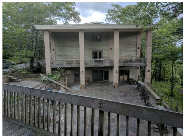
One of the housing facilities