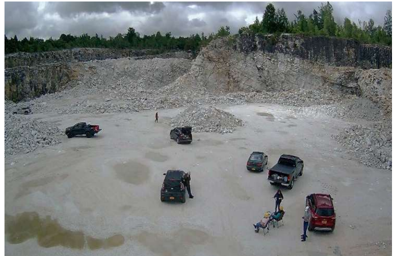
June 8 th ; Drone pic of club members on field collecting trip to Gardenscape Quarry (Ron Zamojski)