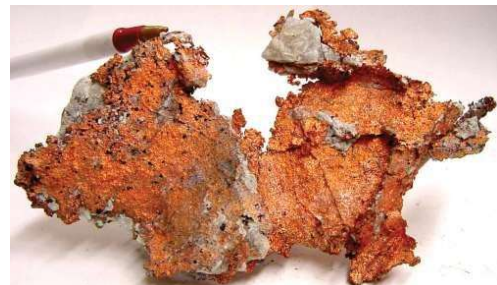
Mineral of the Month: Native copper