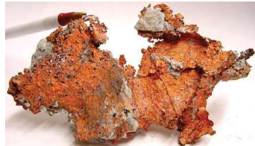
Mineral of the Month: Native copper